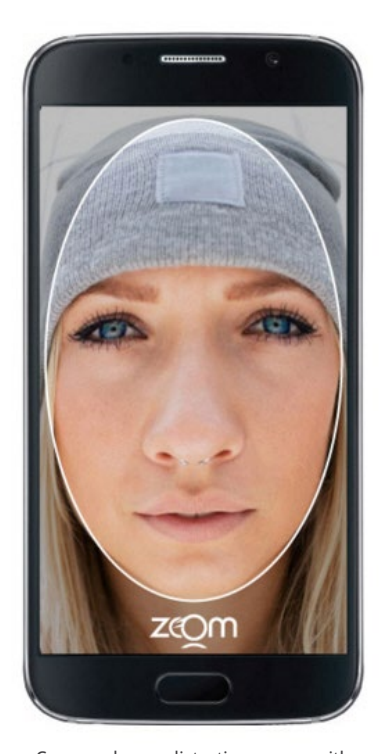
Conversely, no distortion occurs with 2D objects like photos or videos. FaceTec's proprietary algorithms capture ~30 video frames while tracking the motion of the device. The result is a dynamic perspective, 3D face authentication from a standard 2D camera.