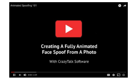
WATCH: In this video we show you how to create a realistic 3D animated spoof from a 2D photograph using CrazyTalk software.