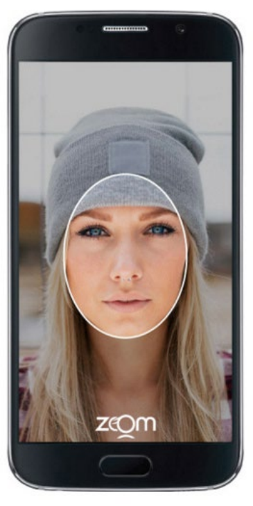
ZoOm observes the user's head, neck, ears, hair, facial features and their environment as the camera is moved closer to the face. During the motion, the camera's view of the face changes and perspective distortion will be observed if the face is 3D.

Based in Denver, Colorado, iBeta performs independent third-party testing and certification for all biometric modalities, and has created the world's first certified Presentation Attack Detection (PAD) test based on the recently released ISO 30107-3 standard. Accredited by NVLAP (National Voluntary Laboratory Accreditation Program), iBeta is the only NIST-certified biometrics testing lab. iBeta's equipment, experience and methodology are invaluable when determining the PAD security level of a biometric, and their test results carry significantly more weight than any in-house or private testing.