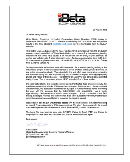
READ : iBeta ZoOm 3D Face Login SDK PAD Certification Test Report Executive Summary

In attaining a perfect score, FaceTec proved that commercially available and affordable face authentication software can stand up to the highest levels of third-party testing scrutiny. While some may argue the benchmark is too high to be viable, biometrics vendors must be pushed to develop measurably robust technology that can rebuff the bad actors in today's increasingly dangerous cyber-land-scape. No one should have to settle for biometrics solutions that haven't passed tests proving that they are capable against a wide range of presentation attacks.